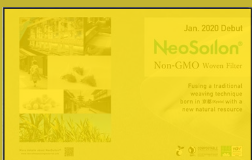
2 page Spread (full bleed) 426 x 283 mm.