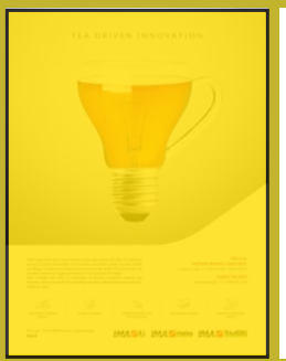
216 X 283 mm.